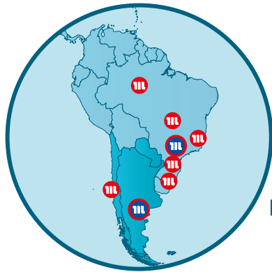
LATIN AMERICA 8 Locations